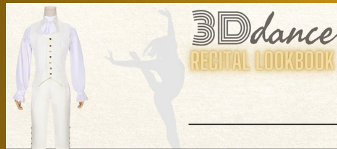
The Ensemble - Extreme/Elite - Tap/Lead Base