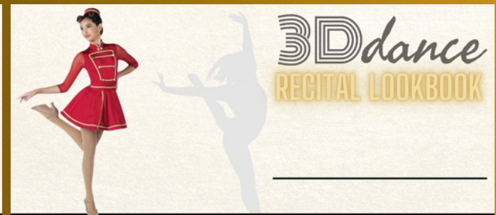
The RedCoats - Mini Jazz - Monday 4:30