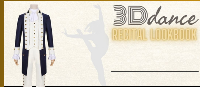
The Officers - Elite - Hip Hop/Act I