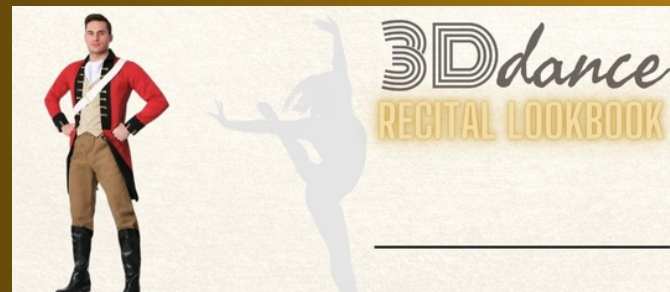
The Advisors - Jr/Tn Musical Theatre - Wednesday 4:45