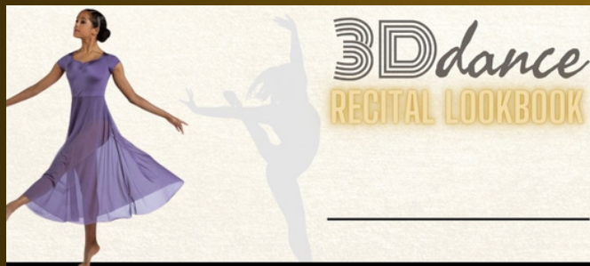
The Rumors - Extreme Classic - Monday 6:45