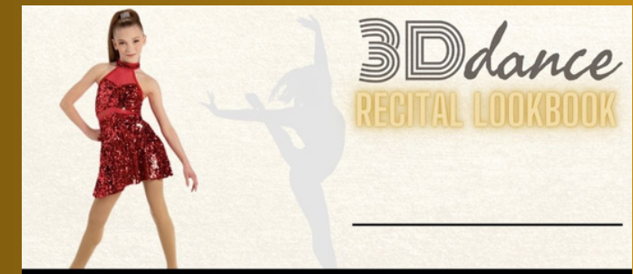
The Yankee Doodle Dandies - Mini Tap - Wednesday 4:45