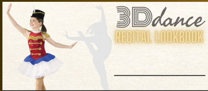
The Stars & Stripes - Mini Ballet - Monday 3:45