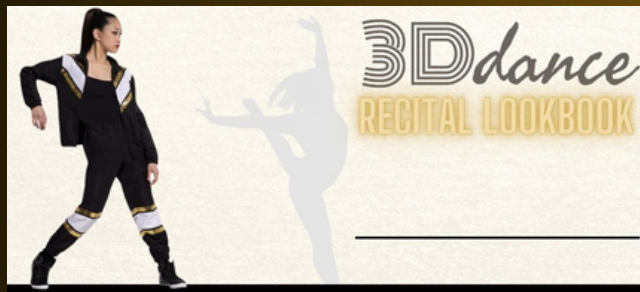
The New Yorkers - Jr/Tn Hip Hop - Monday 6:00