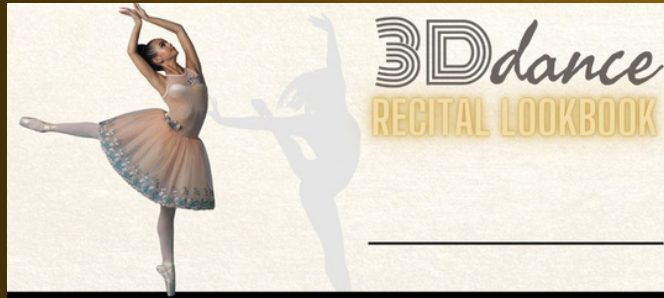
The Gossips - Elite Ballet - Thursday 5:15