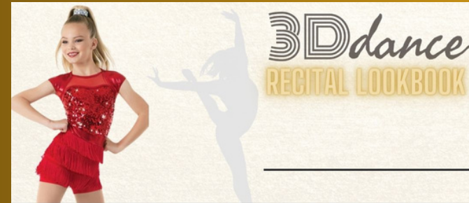
The Liberty Belles - Jr/Tn Baton - Tuesday 6:45