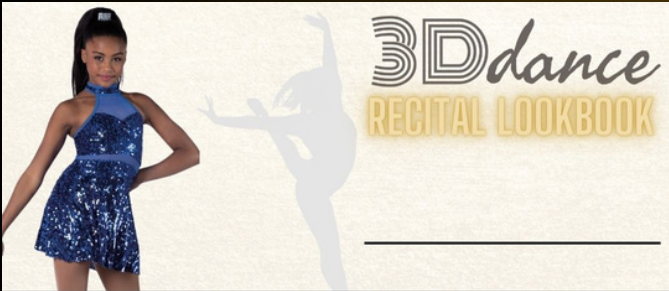
The Yankee Doodle Dandies - Jr/Tn Tap - Wednesday 6:15