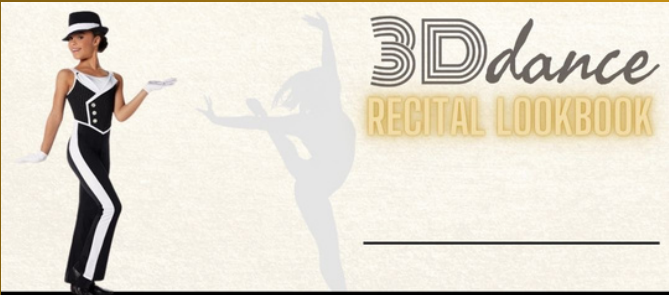
The Attorneys - Excel/Exalt Tap - Tuesday 5:00