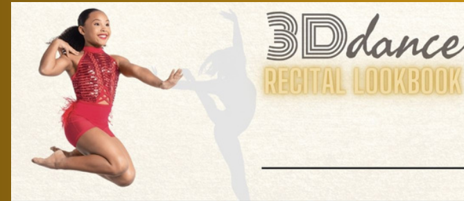
The Uptown Girls - Jr/Tn Acro - Wednesday 7:00