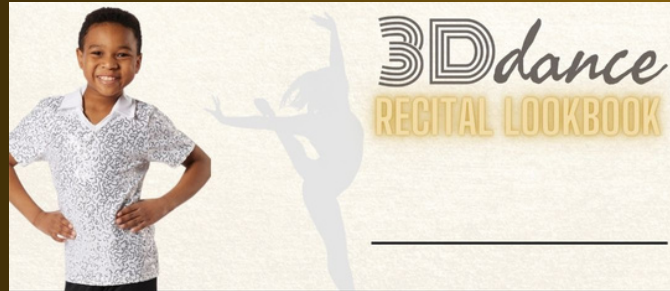
The Yankee Doodle Dandies - Jr/Tn Tap - Wednesday 6:15