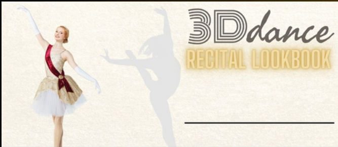
The Cadets - Junior Mix Ballet - Monday 6:45