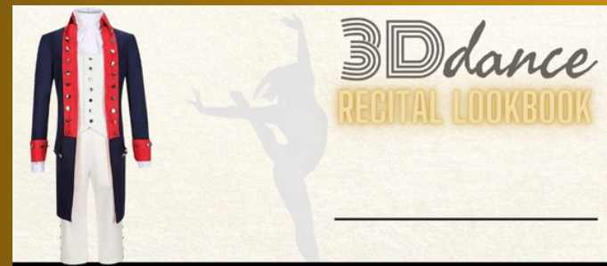
The Troupe - Extreme - Hip Hop/Act I