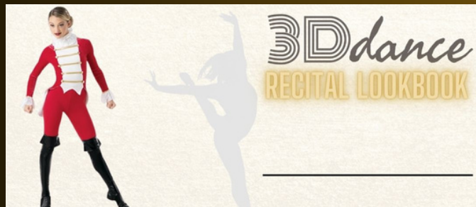
The Advisors - Jr/Tn Musical Theatre - Wednesday 4:45