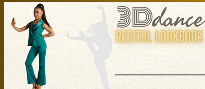
The Voters - Junior Classic - Wednesday 5:30