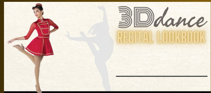
The RedCoats - Mini Mix Jazz - Wednesday 3:30