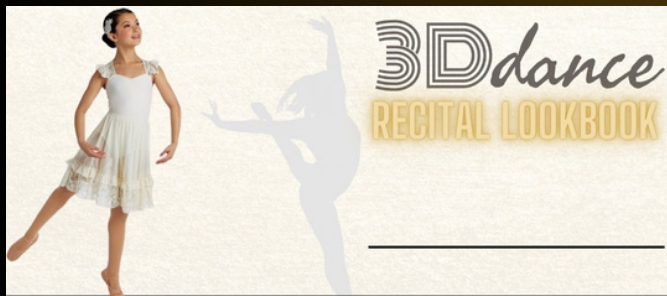
The Orphans - Exalt Ballet - Thursday 4:30