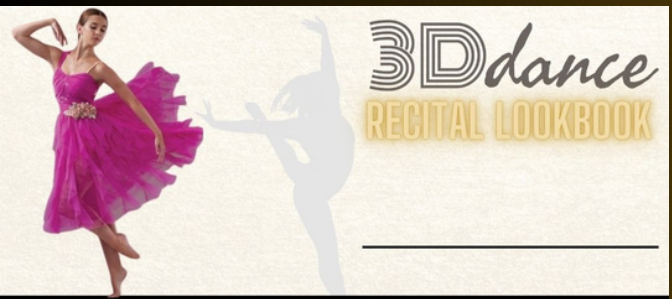
The Bridesmaids - Extreme Ballet - Monday 5:45