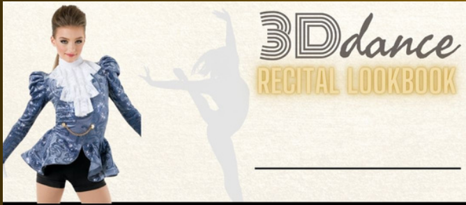
The Patriots - Excel Jazz/Hip Hop - Monday/Tuesday