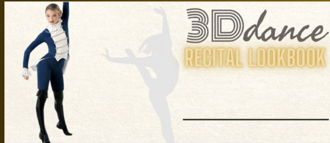
The Abolitionists - Junior Mix Jazz - Monday 6:45