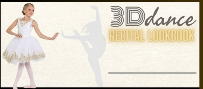
The Debutantes - Mini Mix Ballet - Wednesday 3:30