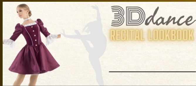
The Revolutionaries - Exalt Jazz/Hip Hop - Tues/Thurs