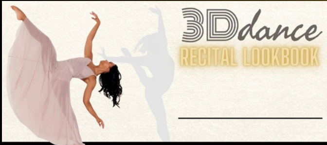
The Mourners - Elite Classic - Thursday 8:45