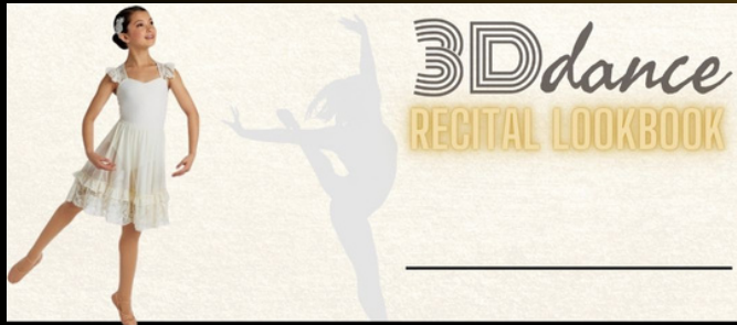
The Orphans - Excel Mix Ballet - Monday 4:30